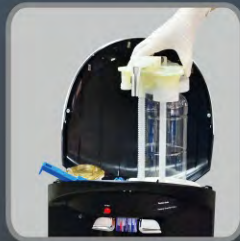
Replaceable Reservoir System SmartFlo™ SF-1 Water Cartridge