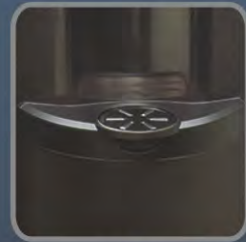
Removable Drip Tray