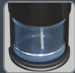
Unique Sliding Front Door