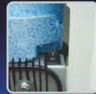
Hot water ON and OFF switch