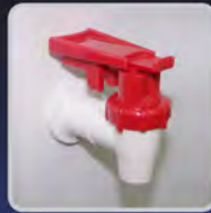
Touch Guard® hot water faucet