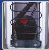
Hermetically sealed reciprocating compressor